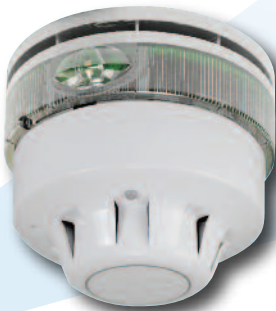
Base Sounder & Beacon Part Number CON456A/CX/W (pictured with head & base)

Optional Voice Sounder version also available - order code BF454A/CX/W