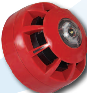
Compact Beacon Part Number CON451A/CX/SR Part Number CON458A/CX/SR