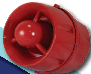
Hi-Output Wall Sounder Part Number CON430A/CX/DR/65