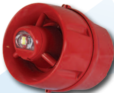
Hi-Output Wall Beacon/Sounder Part Number CON433A/CX/DR/65