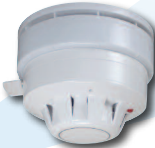
Base Sounder Part Number CON431A/CX/W (pictured with head & base)