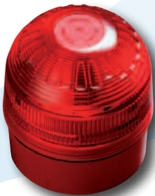
Intelligent Open Area Beacon Part Number 55000-009