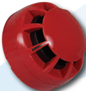
Compact Wall/Ceiling Sounder Part Number CON450/CX/SR

Optional Voice Sounder version also available - order code BF457A/CX/W